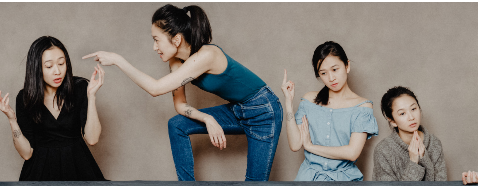
Who Is Listening?. 2018. Digital photography printed on Canson Baryta Prestige 340g 32.5 x 150 cm (unframed) Inspired by "The Last Supper" by Leonardo da Vinci, this remake represents a group of individuals who attempt to communicate with no true intention of listening. Kayee C © All rights reserved.