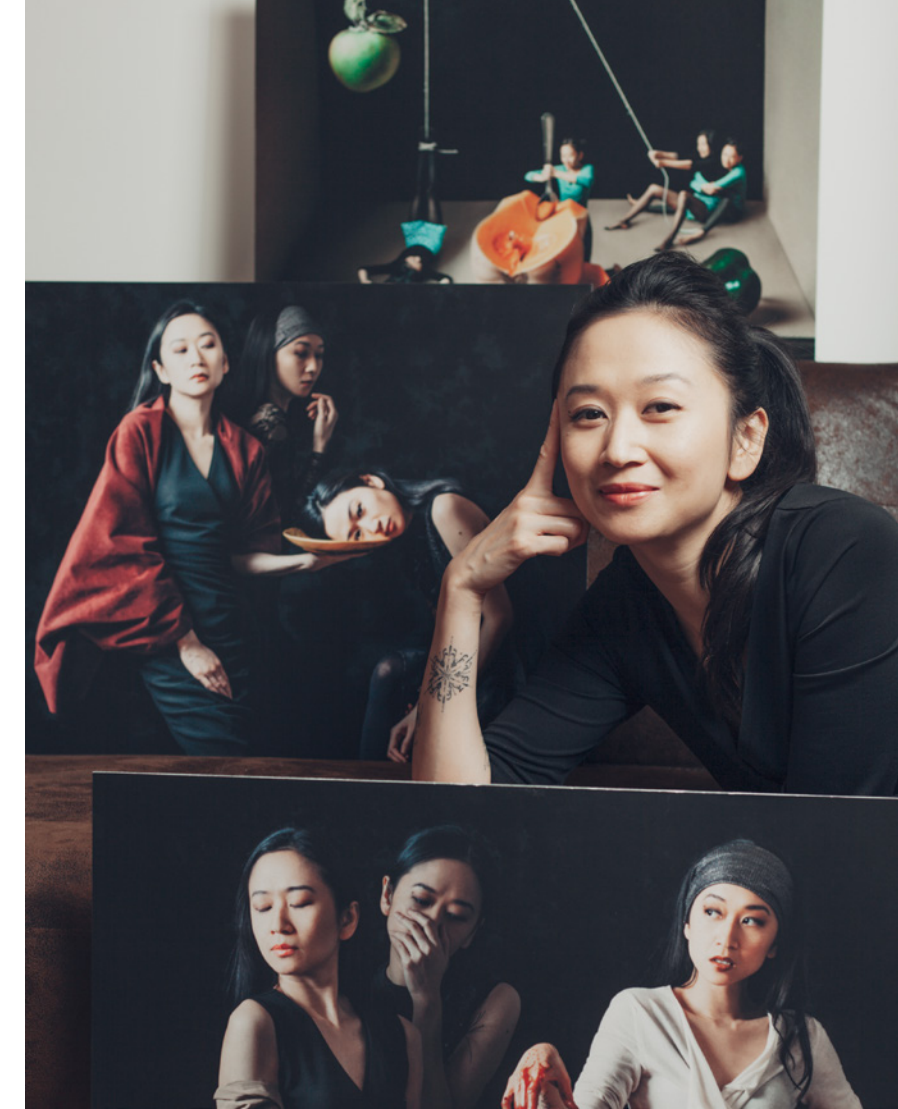
Family Resemblance 2. 2020. Digital photography printed on Canson Baryta Prestige 340g 48 x 60 cm (unframed) Reinterpreting Caravaggio's "Salome with the Head of John the Baptist" (1609), this photo explores family dynamics. Unhealthy interactions within a family can result in attachment styles that some individuals need decades to untangle before they can break through a cycle of pain. Kayee C © All rights reserved.