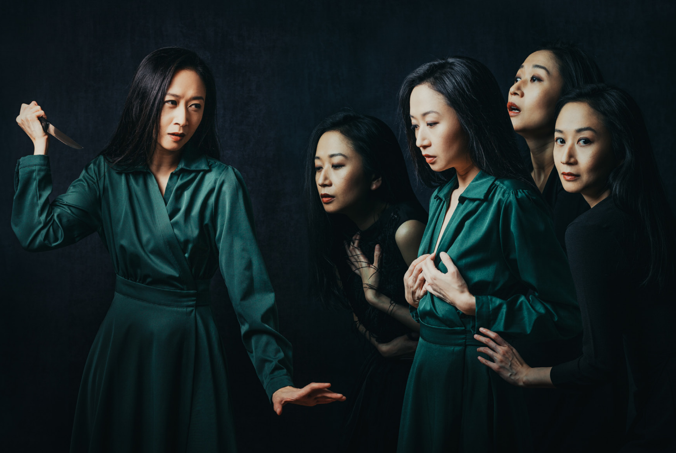
Family Resemblance 4. 2020. Digital photography printed on Canson Baryta Prestige 340g 40 x 60 cm (unframed) Reinterpreting Caravaggio's "The Martyrdom of Saint Ursula" (1610), this photo is a cry for peace when we humans, as one single species, hurt each other based on our differences while we all could coexist with respect. Created in October 2020, after a series of terrorist attacks in France and in Austria.